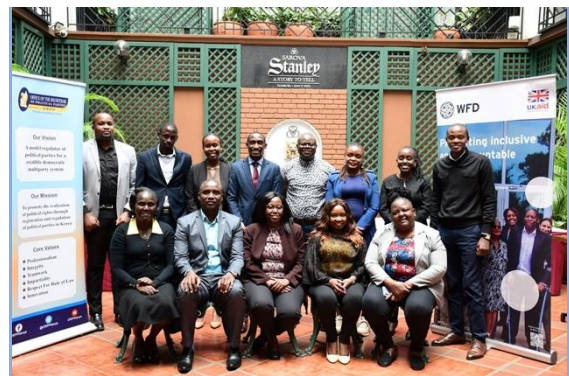
A section of ORPP team and WFD officials after the session at Sarova Stanley Hotel on 7 th August 2024