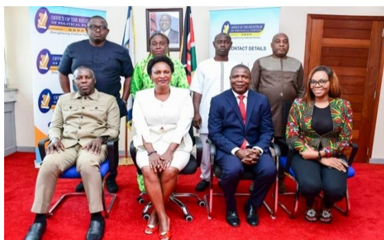
The Registrar and the delegation of Political Parties Regulation Commission (PPRC) of Sierra Leone