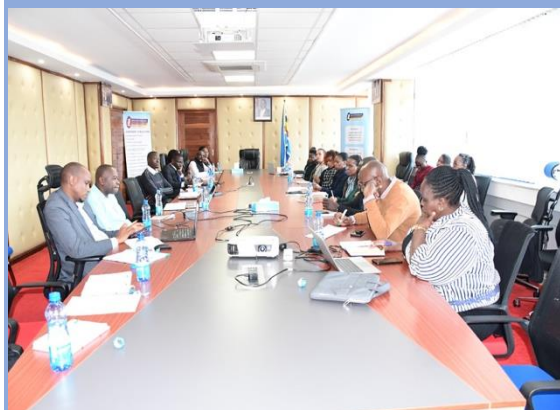
A session of staff during an appraisal session presentation on 28 th August 2024

Staff were advised to embrace the appraisal were while acknowledging that performance appraisals is not a one time event but a continuous process which begins with setting of performance targets at the beginning of every financial year, conducting a mid-year performance evaluations and eventual evaluation at the end of the appraisal period.