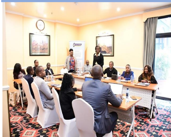
The ORPP team and WFD officials in discussion to chart a roadmap for an Disability and Inclusion Charter

The Charter will build on other Inclusion measures ORPP has in place including proposals for pro-inclusion legal reforms, support of Disability leagues in parties, Disability and Inclusion Policy and Capacity Building initiatives for Special Interest Groups within established party structures.