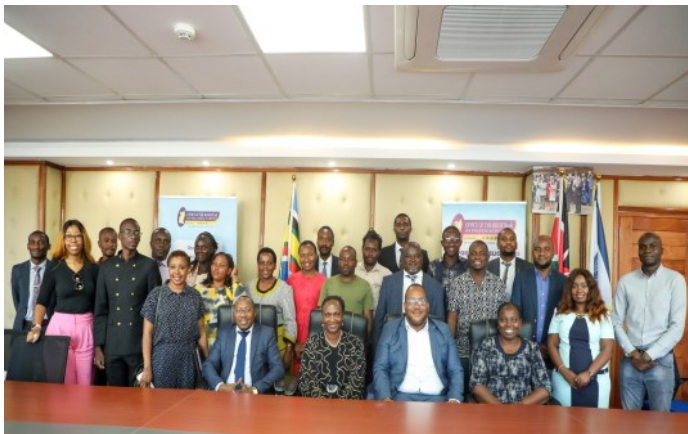
A group photo of ORPP team and Zimbabwe delegate on 14th February, 2024 in the ORPP boardroom headquarters.

Central to the deliberations was areas of collaboration between the two institutions to promote youth inclusion in the political processes. "We are delighted to have ORPP as your destination for learning particularly having to implement impactful youth programmes in political parties", appreciated the head of the delegation.