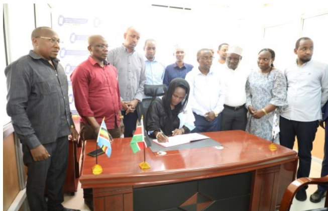
Registrar of Political Parties, Assistant Registrars and Garissa County Officials inaugurate the ORPP Garissa county office at the Office of the Auditor General, North Eastern.

The call for the youth was to bring forth their voices as such