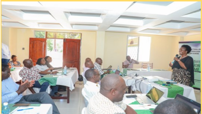
Registrar addresses IEBC Scheme members in Kakamega.

Members' education day for IEBC Pension Scheme members, which has membership of both ORPP and Independent Electoral and Boundaries Commission (IEBC) staff were sensitized on varied topics in a series of forums across the country. On 21st to 23rd February, 2024 in Kakamega Golf Hotel, members in Kakamega, Vihiga, Bungoma and Busia counties convened for the forum to set off clustered sensitizations. Subsequently, others were held in clustered regions to reach the scheme members across the country. The forum conducted by Trustees and service providers sought to update members on a raft of pension matters in line with applicable laws and the Scheme's Trust Deed. Such fora were held between the 12th and 27th of February in clustered counties for varied dates, held in Mombasa, Machakos, Meru, Njeri, Nakuru, Eldoret, Kakamega, Kisumu and Nairobi.