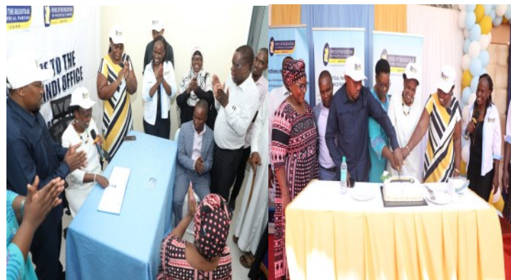
L: Registrar of Political Parties, Assistant Registrars and stakeholders sign a visitors book. R: The same cut a cake to celebrate the launch of Malindi office.

engagement efforts especially on laying ground for targeted political education activities to diverse groups in the larger Coastal Region.