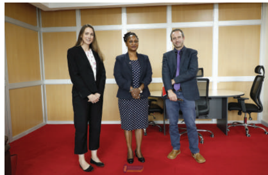
British High Commission officials pay a courtesy visit to the Registrar, the meeting deliberated on matters concerning 2022 General Elections