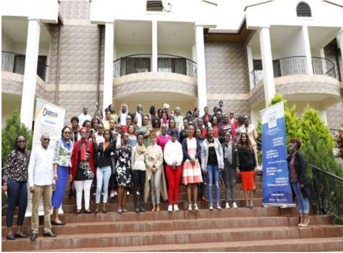
A sensitization workshop on women leadership for aspirants and a section of PPLC members held on 8th October 2021 at Panari Hotel, Nyahururu