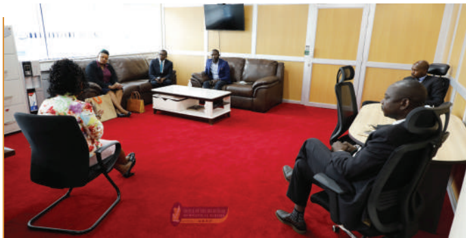
A section of Wiper party officials pay a courtesy call to the Registrar's to deliberate and seek guide on varied political processes on 3rd August 2021