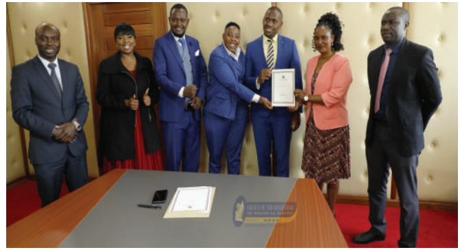
A section of Chama Cha Kazi officials receive their full registration certificate on 19th August 2021