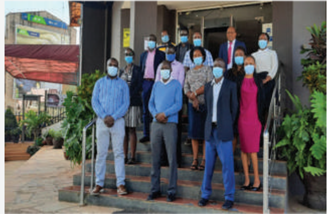
ORPP team and participants drawn from various Civil Society Organizations during the meeting