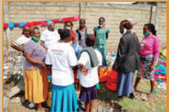
A section of Reli women group along the railway line in Mukuru slums demonstrate washing of used packing bags, which they subsequently sell to earn a meagre living at various markets in Nairobi.

The visit presented a rare opportunity for ORPP to share contextualised life skills talks, experiences as well as presenting assorted dry food items bought from the proceedings of staff voluntary contributions. Specific areas of focus of the talks centred on resource-pooling mechanisms to set up sustainable income-generating small scale ventures as well as guidance for the women to actively participate in political processes and general leadership roles. The Registrar of Political Parties, Ann Nderitu noted that the Office will continue to support such vulnerable groups as part of ORPP care for the less-privileged as underpinned in the Corporate Social Responsibility Policy and Strategy. "We want to be that organisation that is connected with the society as is integral to our service delivery", noted Ms. Nderitu.