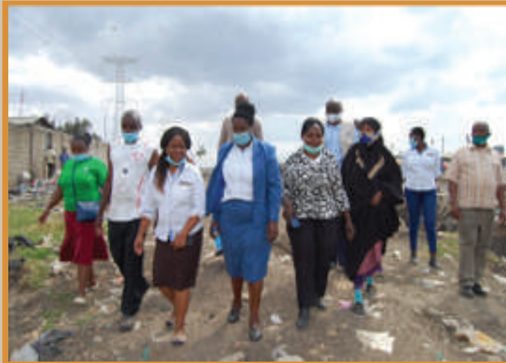
ORPP team and local leaders take a walk around Mukuru slums to the Reli women group’s washing area

One of the way forward out of the day’s deliberations was for ORPP to further engage with the relevant leaders in the community for long term solutions to afford them a decent living. Further, it was agreed for heightened community programmes that also targets boys, to attain a balanced society in future. Currently, Reli women group has 41 members and has been registered as a self-group by the relevant authorities.