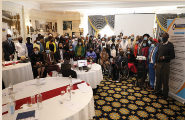
Participants pose for a group photo

The deliberations were hinged on the need for additional efforts towards mainstreaming PWDs in