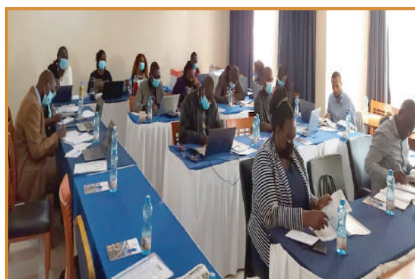
Participants during the Medium Term Expenditure Framework (MTEF) workshop held in Naivasha on 17th to 22nd August, 2021

ury and Planning Ukur Yatani. It indicates that all effort must be made for full scale implementation recovery strategy that aims to reposition the economy in line with Medium Term III of the Vision 2030, the Big Four Agenda and Post Covid-19 Recovery Strategy