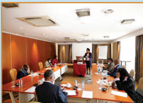
Registrar of Political parties addressing the participants during the forum.

Initial task on the subject projected for the Committee upon finer consultations with other stakeholders and formulation of Terms of Reference will be to: devise ways for conflict resolution mech-