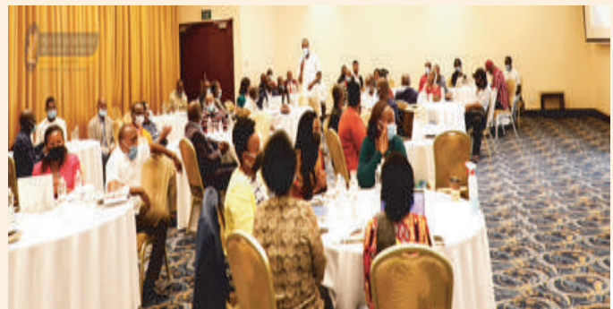
Secretary Generals of Political Parties at Sarova Woodlands