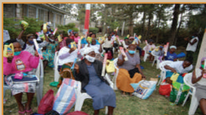
Representatives of Reli Women group filled with jubilation after receiving life skills talks and donations from ORPP. The event was held at Mukuru Medical Missionaries (MMM) in Mukuru kwa Njenga, Nairobi.