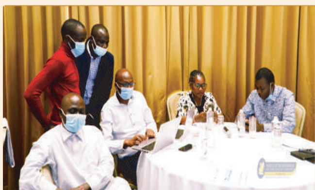
ORPP staff discuss matters on IPPMS piloting phase

The political parties resolved to act and review recruitment procedures and processes in line with Political Parties Act , 2011 and Data Protect Act, 2019 and act on concerns raised by numerous (over 4,000 received at ORPP) Kenyans during on boarding of Integrated Political Parties Management System (IPPMS) piloting phase.