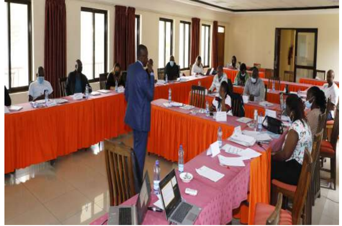
Orientation of ORPP new staff members at the Sentrim Hotel, Naivasha held on 13th October 2021