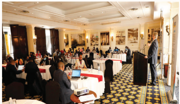
Sensitization of Youths leaders on political governance processes held at Sarova Stanley Hotel on 27th August 2021.