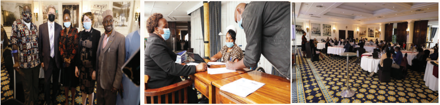
Participants during the sensitization of Persons with Disabilities (PWDs) on various political governance processes held at Sarova Stanley Hotel on 26th August 2021.