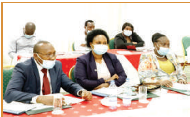
Registrar (middle) and assistant Registrars (L&R) following through the presentations

We remain steadfast and putting forth best effort to meet the needs of the stakeholders including the Kenyans we serve”, Registrar assured in her remarks during the forum. She added that the Plan also sets a quality bar higher for the ORPP to achieve the strategic issues identified. “While we will do our best as ORPP, we call for your continued support as stakeholders in attending to respective expectations isolated in the Plan for a collaborative attainment stipulations contained in this Plan”, she observed.