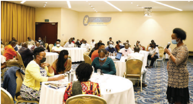
Registrar addresses the Secretary Generals of various Political Parties during the compliance meeting held on 27th and 28th July 2021 at Sarova woodlands, Nakuru.