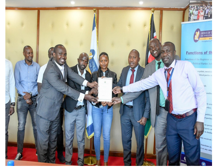
The We Alliance Party (TWAP) receive certificate of provisional registration on 2nd December 2022 at ORPP's boardroom 4th floor headquarters.