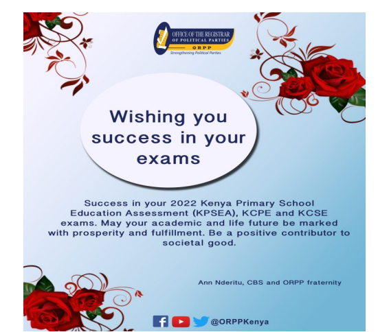
Wishes of ORPP to KPSEA, KCPE and KCSE 2022 candidates

Produced by: Corporate Communication Unit