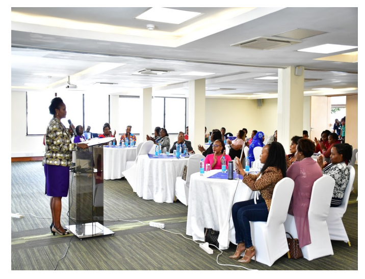
Registrar gives her speech during post 2022 general election reflection for women in leadership forum on 10th November at Jacaranda hotels, Westlands.

post-2022 general election reflection forum for women in political leadership was held in Nairobi on 10th November 2022. ORPP was deliberate in identifying bottlenecks and championing the necessary support to enhance the participation and inclusion of women in politics.