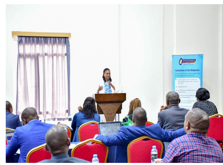
Registrar of Political Parties address stakeholders who attended the forum on 15th November 2022 in Machakos.

The Registrar while speaking at the start of the forum, appreciated stakeholders for their support and collaboration, a positive factor in the realization of ORPP's successes in the last general election. "This election evaluation exercise will help us identify the gaps and the possible areas of linkages and improvement going forward", said the Registrar while highlighting the raft of reforms undertaken.