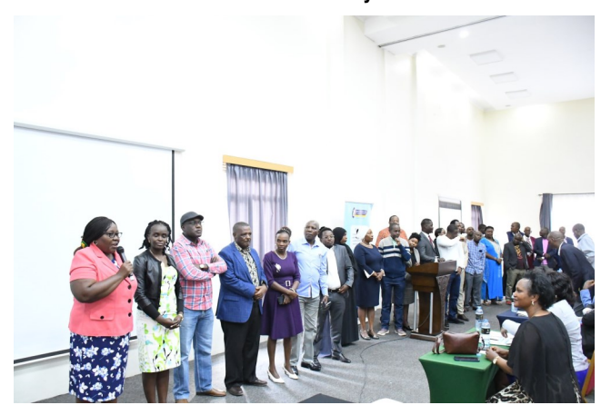
Contestants of the National Steering Committee introduce themselves ahead of PPLC elections.

The Registrar of Political Parties led discussions on civic and political awareness programmes and support of special interest groups in political parties were some areas of possible areas of collaboration coalesced.