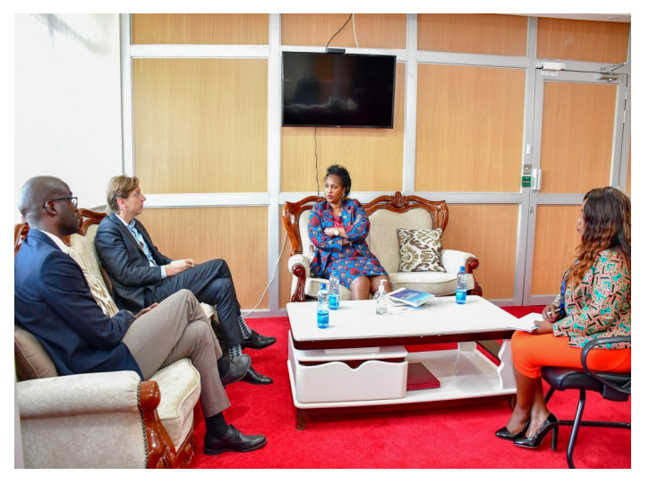
Officials of the Netherlands Institute for Multiparty Democracy (NIMD) at the Office of the Registrar of Political Parties on 9th November 2022

etherlands Institute for Multiparty Democracy (NIMD) paid a courtesy visit to the Registrar of political Parties at her office on 9th November 2022 on a friendly study visit.