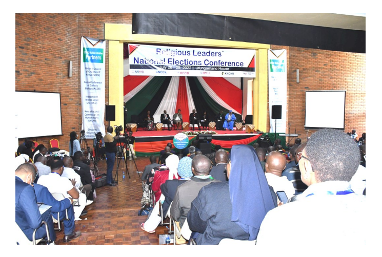
Registrar of Political Parties (third from left) speaking during the panelist discussion of Religious leaders' national election conference on 28th July 2022 at Ufangano house, Nairobi

Key topics of discussions in the forum was attended by Independent Electoral and Boundaries Commission (IEBC), Election Observation Group (KENYA), USAID Kenya, Kenya Conference of Catholic Bishops(KCCB), Independent Medico Legal Unit IMLU, Kenya National Commission on Human Rights (KNCHR) and Electoral Law and Governance Institute for Africa (ELGIA).