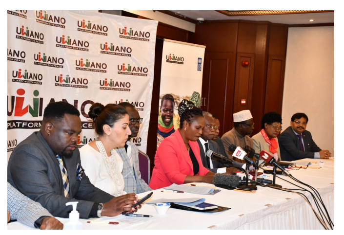
Registrar of Political Parties together with officials of Uwiano stakeholders at a joint presser issue a statement at Serena Hotel on 26th July 2022, Nairobi