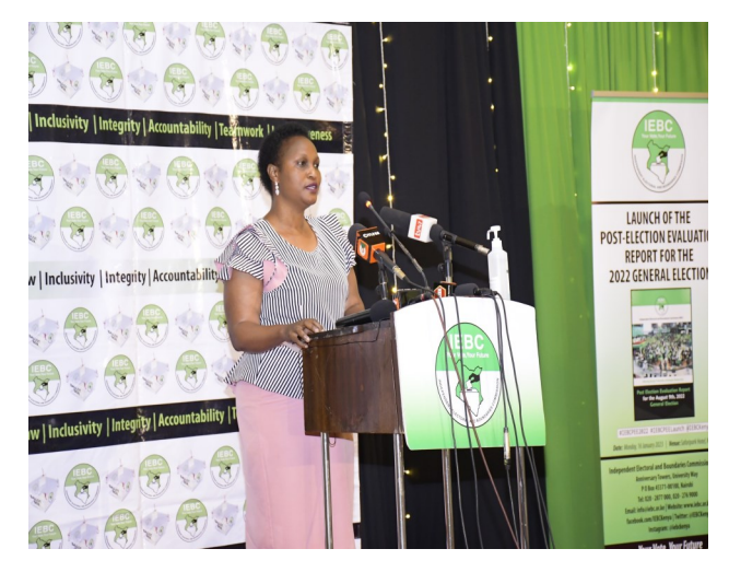
Registrar of Political Parties making her remarks during the launch

"The launch of this report will provide every stakeholder a chance to examine their contribution towards the just concluded election and inform areas for improvement based on critical raft of its observations, challenges, and recommendations.