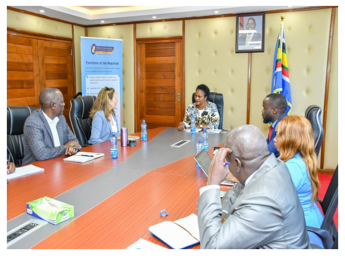
Registrar of Political Parties chairs an on-going discussion between officials of USAID, European Centre for Electoral Support (ECES) and a section of ORPP officials at the boardroom headquarters

European Centre for Electoral Support (ECES) paid a courtesy visit to the Registrar of Political Parties. Collaborative initiatives on political education to targeted groups including Special Interest Groups, spearheading necessary legal reforms borne of the experience of the concluded August al Review of Election Pro- Support and enhance-2022 general election among other areas were discussed.