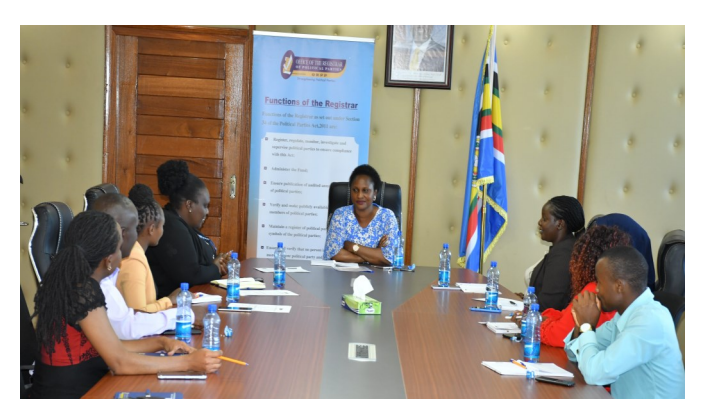
Registrar of Political Parties in a formal meeting with new staffs at 4th floor boardroom

to duty at varied dates between December, 2022 and Janu- Staff Code of Conduct some of which pertains to discipline. ary, 2023. This was commenced on advertisements in pub- avoiding casualness and embracing professionalism in and lic media and ORPP website of the vacancies on 8th Febru- out of work station. ary 2022.