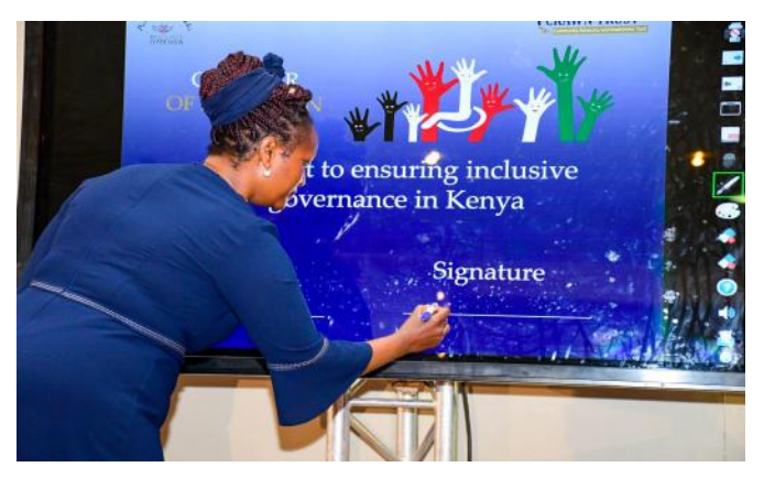
Registrar of Political Parties signs the inclusion Charter document at Desmond Tutu conference center, Westlands Nairobi,

She outlined the affirmative action ORPP had taken to ensure inclusivity such as; ensuring compliance of the 2/3 gender representation in political parties membership and leadership; Amendments of the Political Parties Act especially section 25 which expands the eligibility of Political Parties to qualify for Political Parties Fund based on the number of Special Interests Groups among others.