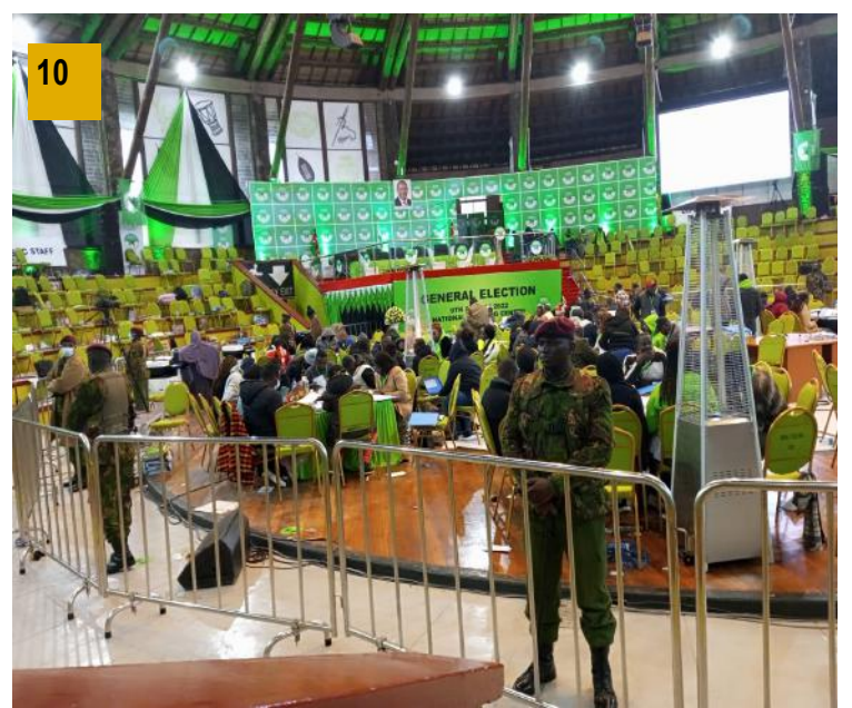
10. Preparation underway for the final announcement of Presidential results, at National tallying center on 15th August, 2022 Bomas of Kenya.

Produced by: Corporate Communication Unit