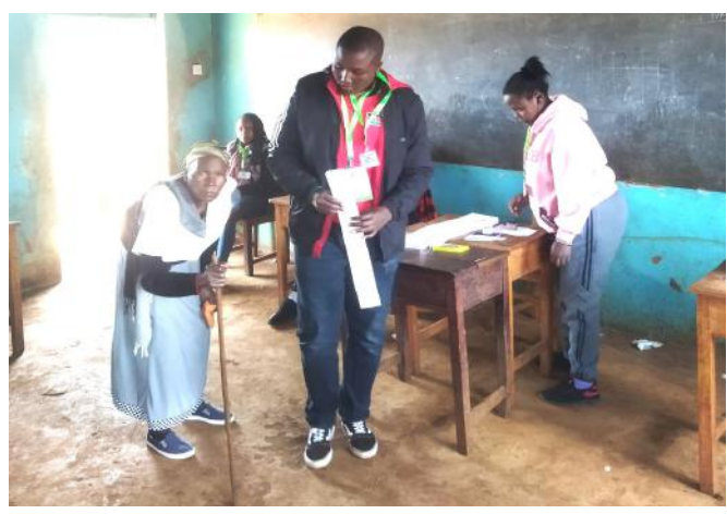
Some of the voters being guided on procedure of voting Pokot West constituencies and Nyaki West ward of Imenti North, Meru County

In the contest, political parties candidates carried the day with only one independent candidate clinching an MCA seat in Kwa Njenga ward of Embakasi South Constituency.