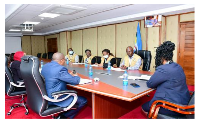
Officials of ZESN hold a discussions with Registrar of Political Parties at ORPP headquarters boardroom.

iscussions held revolved around actions taken by ORPP in preparation for the general election. Some cited were the ongoing countrywide monitoring of Tuesday 9th general election from 6th to 12th August, training of parties' agents; capacity building The Registrar briefed on capacity building of party organs to party organs, and targeted groups among other initiatives.