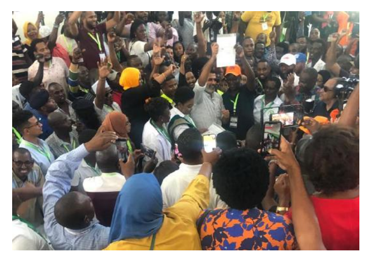
Declaration of Abdulswamad Nassir has the governor elect for Mombasa county.

Declared winners by respective IEBC's returning officers Democratic Movement Party; Titus Lotee Kacheliba Con- erated insights critical for subsequent policy direction. stituency) of Kenya Union Party (KUP) was declared the winner of Kacheliba parliamentary seat in West Pokot County. David Mwalika (Kitui Rural) of Wiper Party, Kenya Union Party (KUP) David Pkosing (Pokot South), parliamentary election; United Democratic Party (UDA) Paul Kibet Chebor (Rongai Constituency) Kirima Kimondo (Nyaki West ward) and; Francis Kiragu Kimondo Independent candidate for Kwa Njenja ward also won the elections respectively.