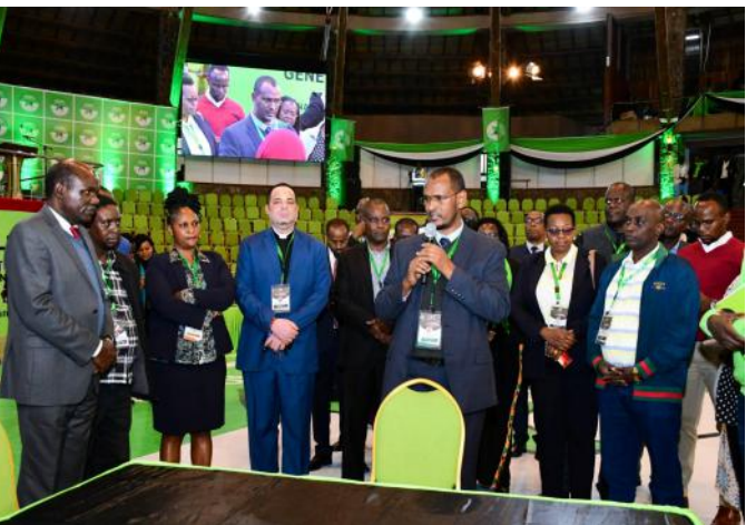
Registrar of Political Parties (third from right) together with Registrar of Political Parties Sudan, IEBC senior officials and political parties representatives at the Bomas of Kenya ahead of the general election.