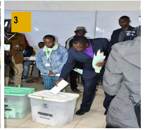
1. ORPP Nairobi based team monitoring elections within Kiambu, Nairobi and Kajiado counties. 2. Kenyans queue to exercise their democratic right as voters on 9th August, 2022. 3. Agano party presidential candidate casts his vote at Upperhill secondary polling station, Kibra constituency.