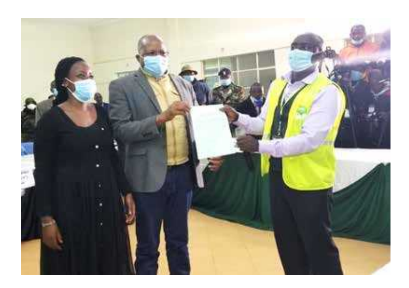
A Returning Officer of the Independent Electoral and Boundaries Commission (IEBC) issuing certificate to the declared winner of Bonchari constituency by election. The ORPP monitored the by-election

Pursuant to its role to monitor and supervise political parties under section 34 of PPA, the Office monitored compliance with the code of conduct by political parties in by-elections held during the period under review. The monitoring exercise covered areas of distribution of election materials, voting, tallying, announcement and declaration of results.