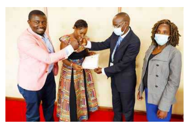
Chama ya Mapatano Kenya officials receive certificate of provisional registration at the ORPP headquarters office in June, 2021

During the period under review, the Office received twenty-nine (29) formal applications for provisional registration and notices published in the Kenya Gazette and newspapers of nationwide circulation inviting objections from public. The table below provides the names of the formal applications for provisional registration.