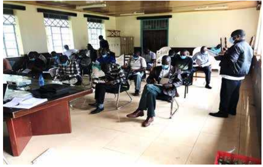
A session of agents training being conducted by ORPP in Matungu constituency, Kakamega county

During the year under review, the Office conducted training of political parties and independent candidates' chief agents involved in by-elections for election of five (5) member of National Assembly, twelve (12) member of County Assembly and one (1) member of Senate. A total of seven hundred and thirty-six (736) agents were trained.