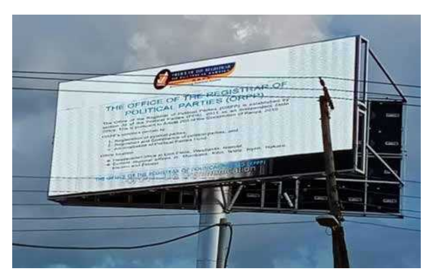
ORPP advertisement running on an electronic billboard in Eldoret town