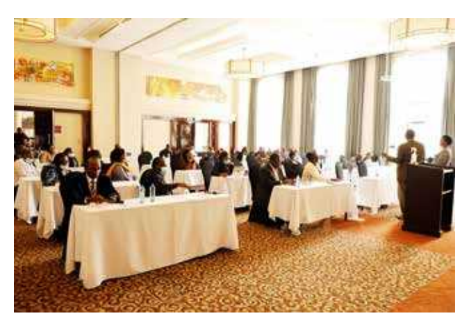
Compliance workshop with political parties' officials held at crown plaza hotel, Nairobi

Political parties that had breached the compliance requirements were notified and directed to remedy the breaches in line with section 21 of the Political Parties Act, 2011.