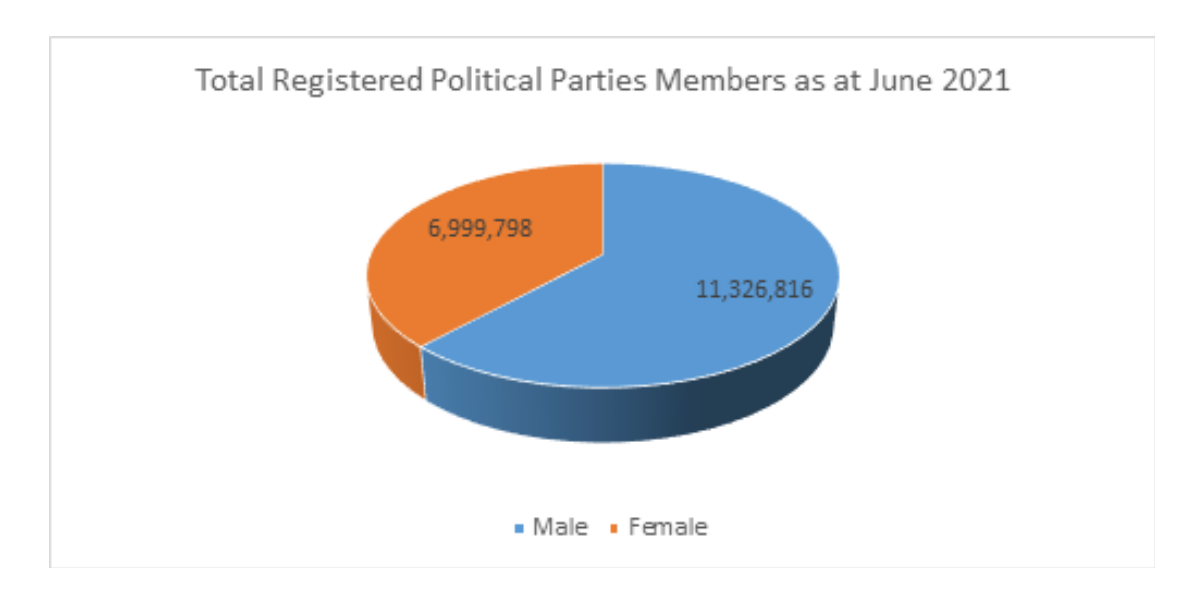
Fig 2.1: Registered Political Parties Members by Gender

The ORPP maintains an up to date register of political party members and symbols and ensures that, no person is a member of more than one political party at the same time. The membership of the party should be voluntary and open to all the citizens of Kenya without discrimination on account of gender, disability, religious belief, race, tribe, ethnic origin, profession or occupation. As at 30th June 2021, the political parties membership was eighteen million, three hundred and twenty-six thousand, six hundred and fourteen (18,326,614) comprising 61.8% male and 38.2% female.