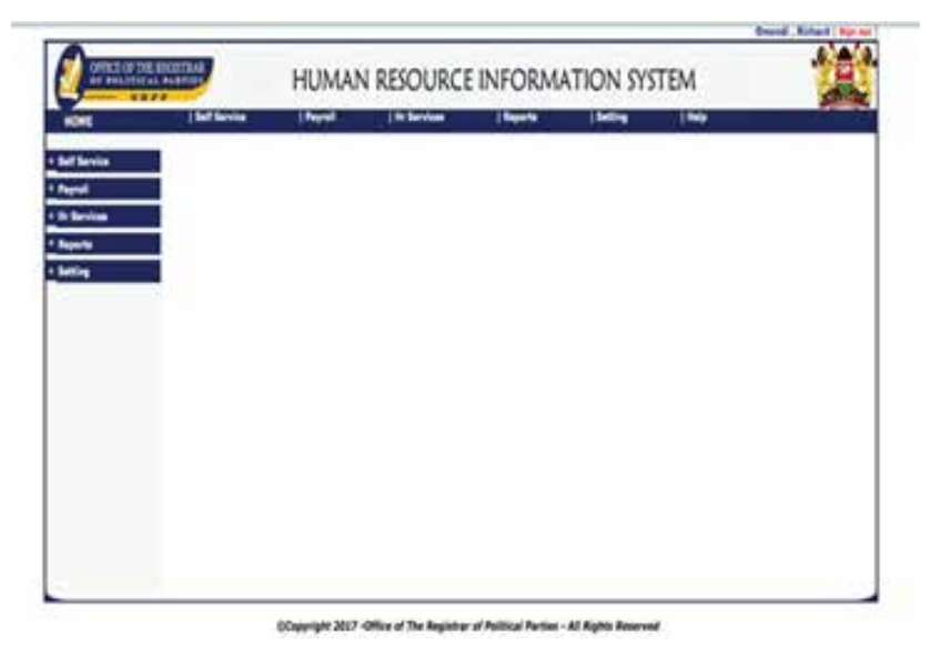
Computer view of ORPP HR system